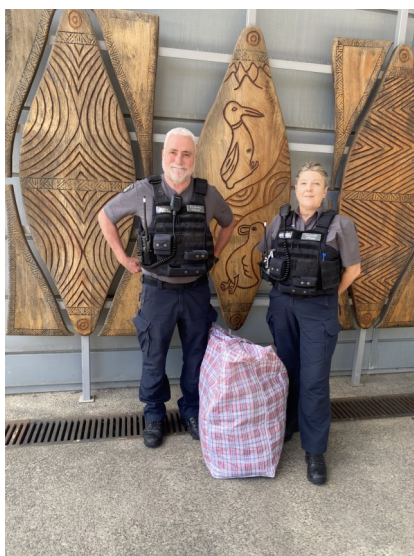
Above: Custody officers at Morwell were grateful for a large bag of clothes for people in custody donated by Fossick and Find. It's good to help people maintain their dignity.

We will be allocated a student in March or April and we will learn more about our near neighbours and their churches.